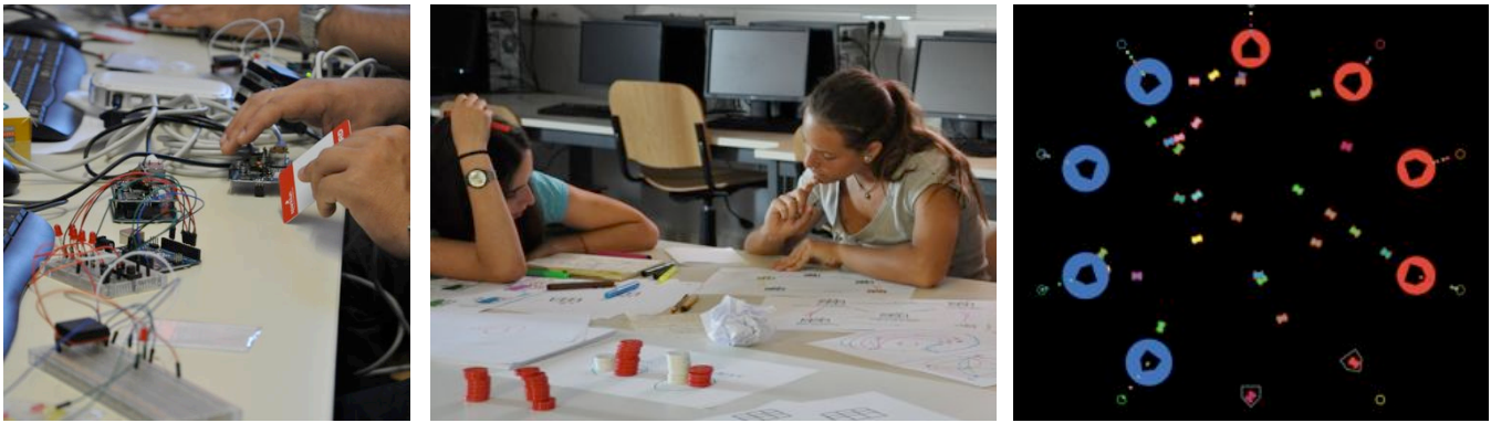
Figure 2. Electronics team programming RFID sensors (left); the game design team (center); AB model of simulation team (right)